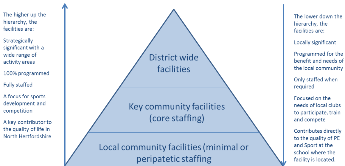
Figure 3: Suggested facility hierarchy for North Hertfordshire – core principles

As an example, it is assumed that District wide facilities will include wet and dry facilities such as Royston and North Hertfordshire leisure centres, with key community facilities including Hitchin and Knights Templar sports centres. This then leaves schools with community use to pick up the local community need.