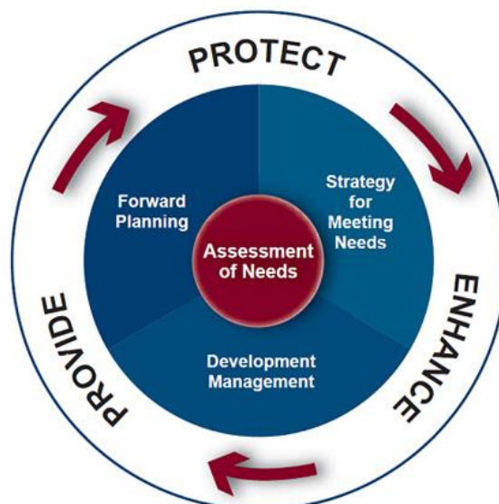
Figure 2: Sport England Strategic Planning Model

This Indoor Sports Facilities Strategy seeks to provide all partners and stakeholders in North Hertfordshire with a valuable tool that guides internal and external investment decisions, supports applications for external funding and informs key management decisions.