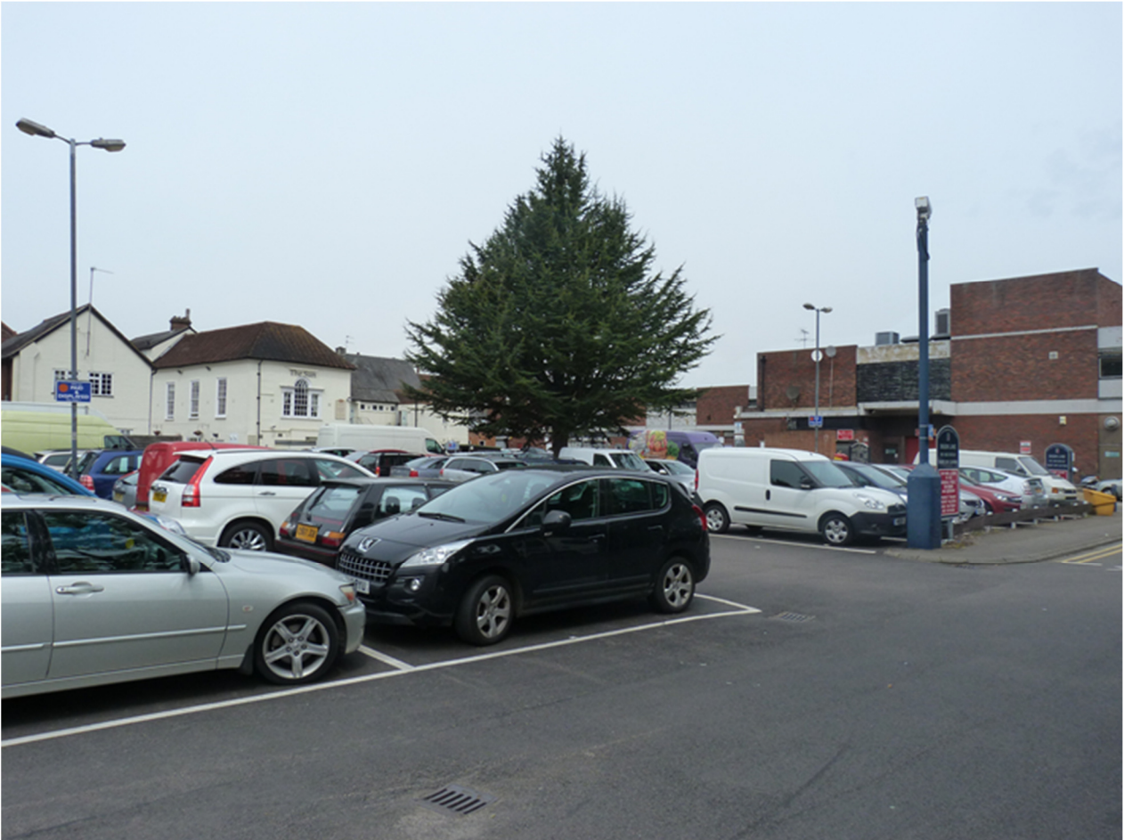
Plate 1: Northwest facing photograph showing service range for the 1970s Churchgate shopping centre.