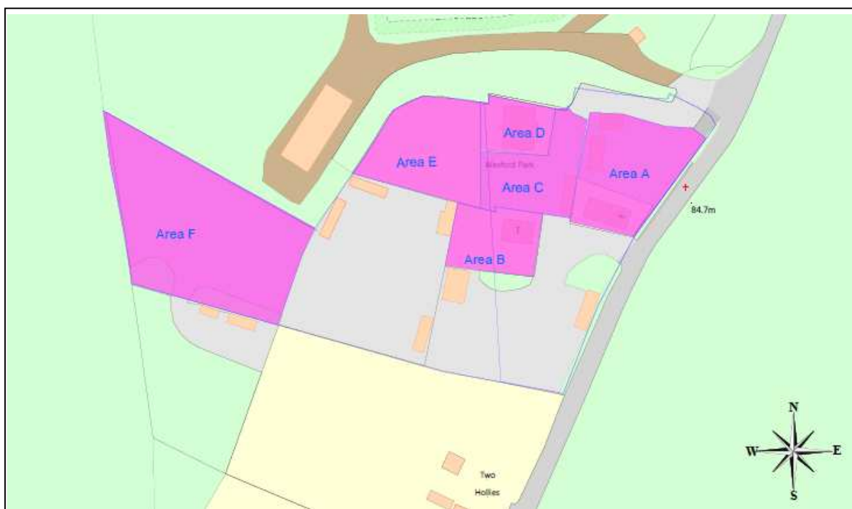
Figure 3: Outline of site area