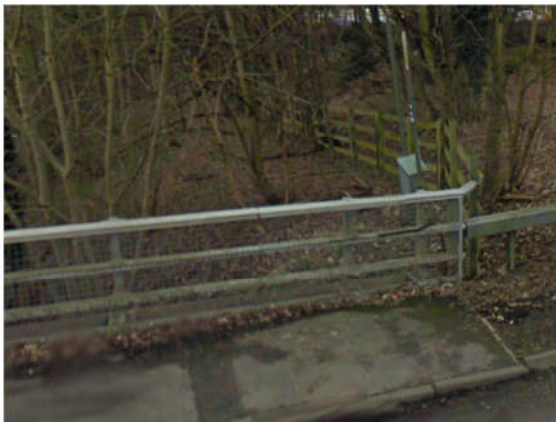
Additional 2009 view