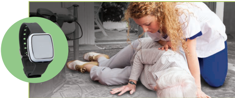
Falls detector that automatically triggers if it senses a fall

A tailored package of sensors can be provided to meet the specific needs of every resident, enabling them to live independently at home for as long as possible. These sensors will link via the community alarm unit to our Control Centre in the same way, but will automatically trigger if they sense a risk. This means the householder has a high level of automated support. It can be in the form of, but not limited to: