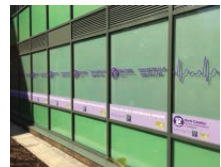
24/7 Control Room in Letchworth-Garden-City, Hertfordshire