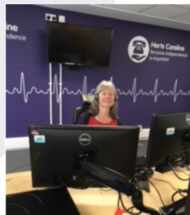
Our Control Centre, based in Letchworth Garden City, Hertfordshire