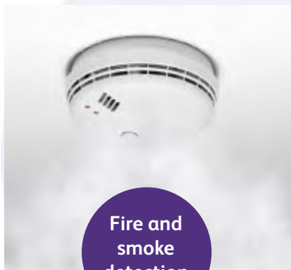
Fire and smoke detection

Need to be aware of: If the service user or patient or live-in carer is hard of hearing then we can provide a range of amplification, visual, or physical alert equipment so that can react quickly in the event of a fire.