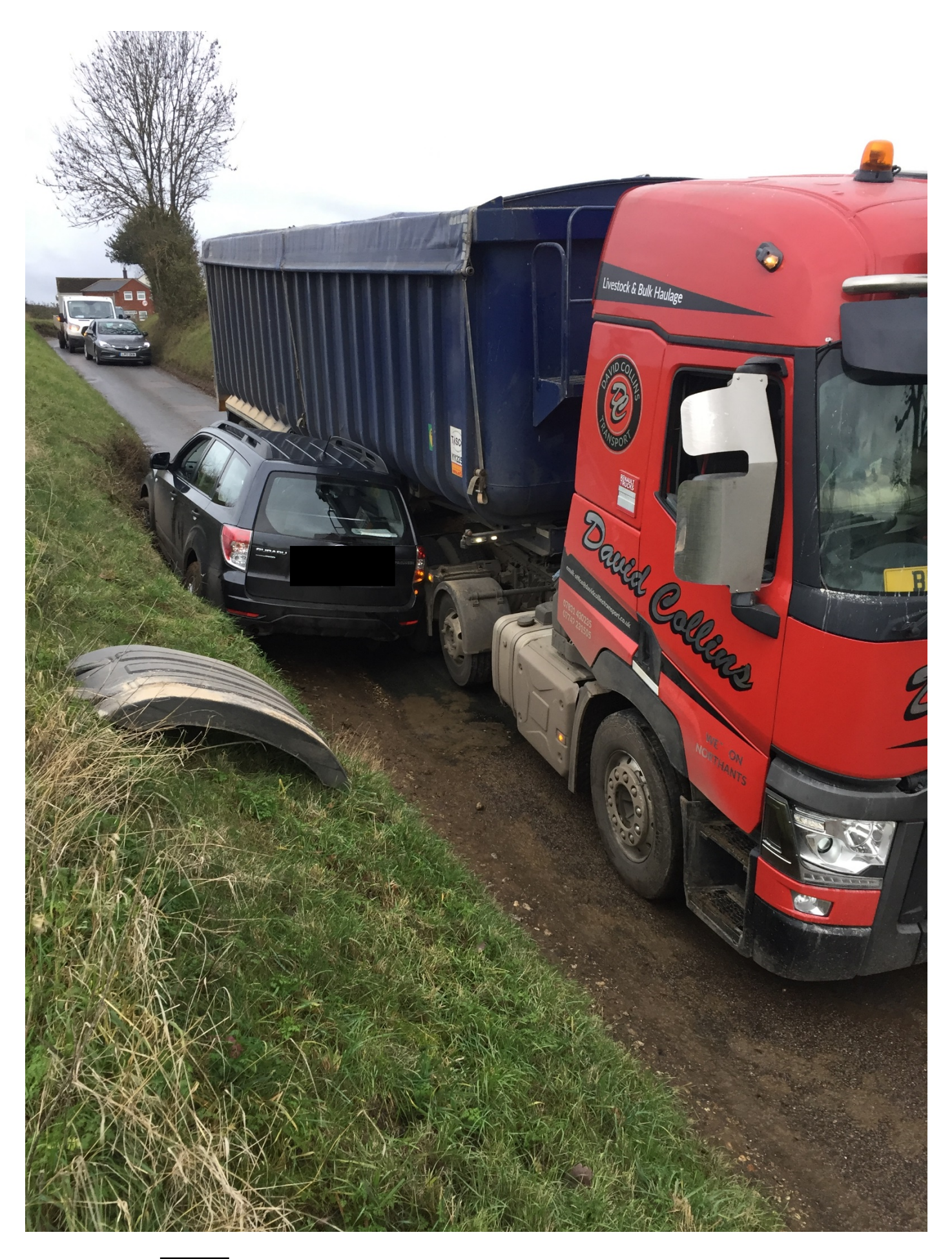
Picture 2 – As car was being crushed by the big red lorry she had to climb out of the window on the other side, because she thought she was going to be crushed to death.