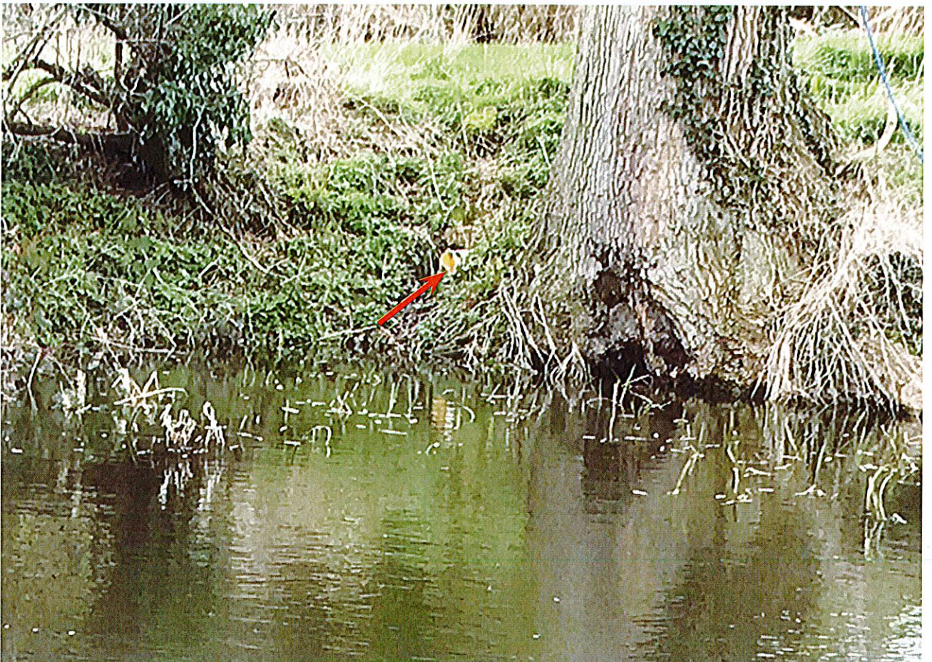
Drainage from CD1 ditch