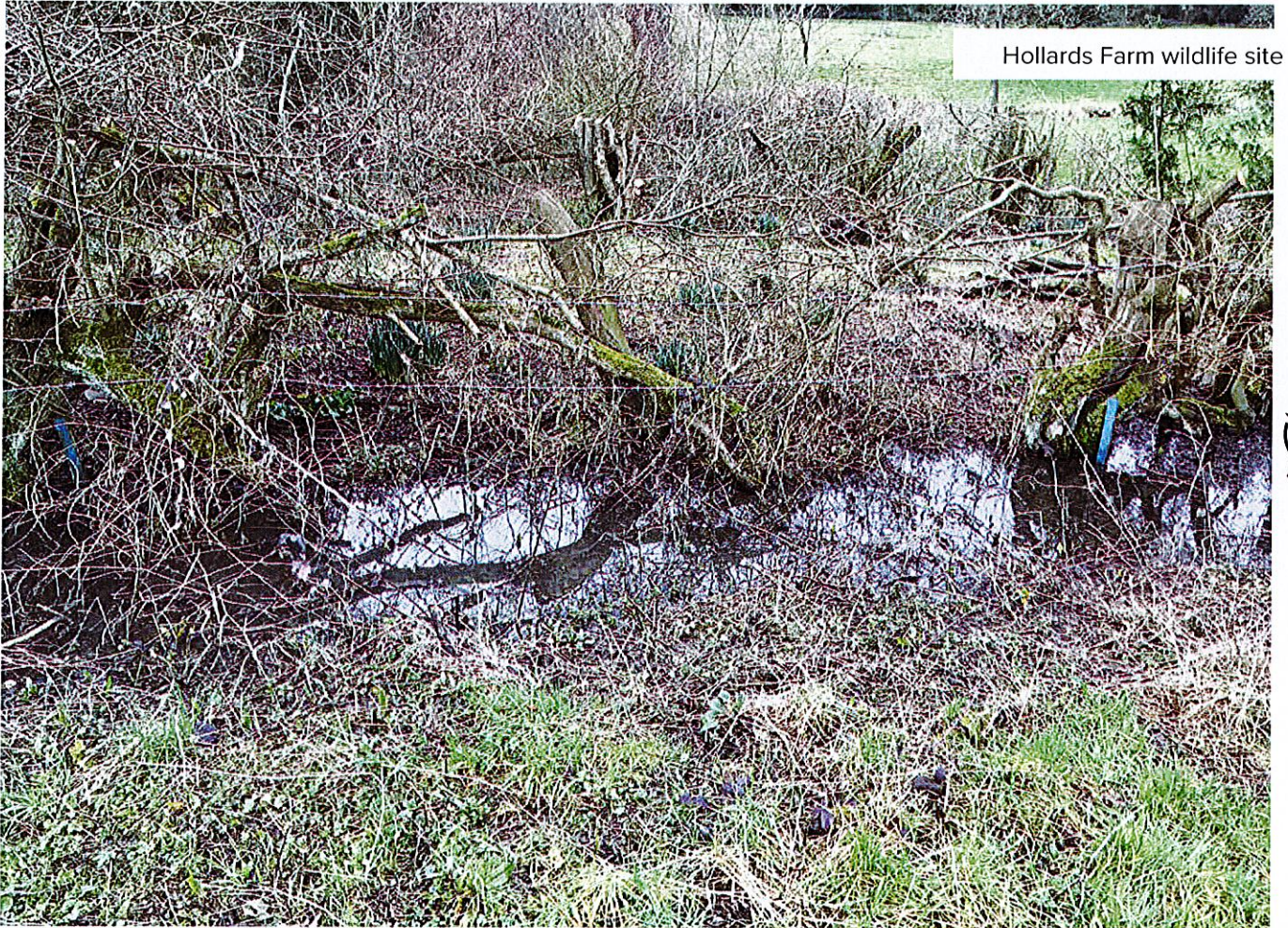
CD1 - Cowards Lane drainage ditch