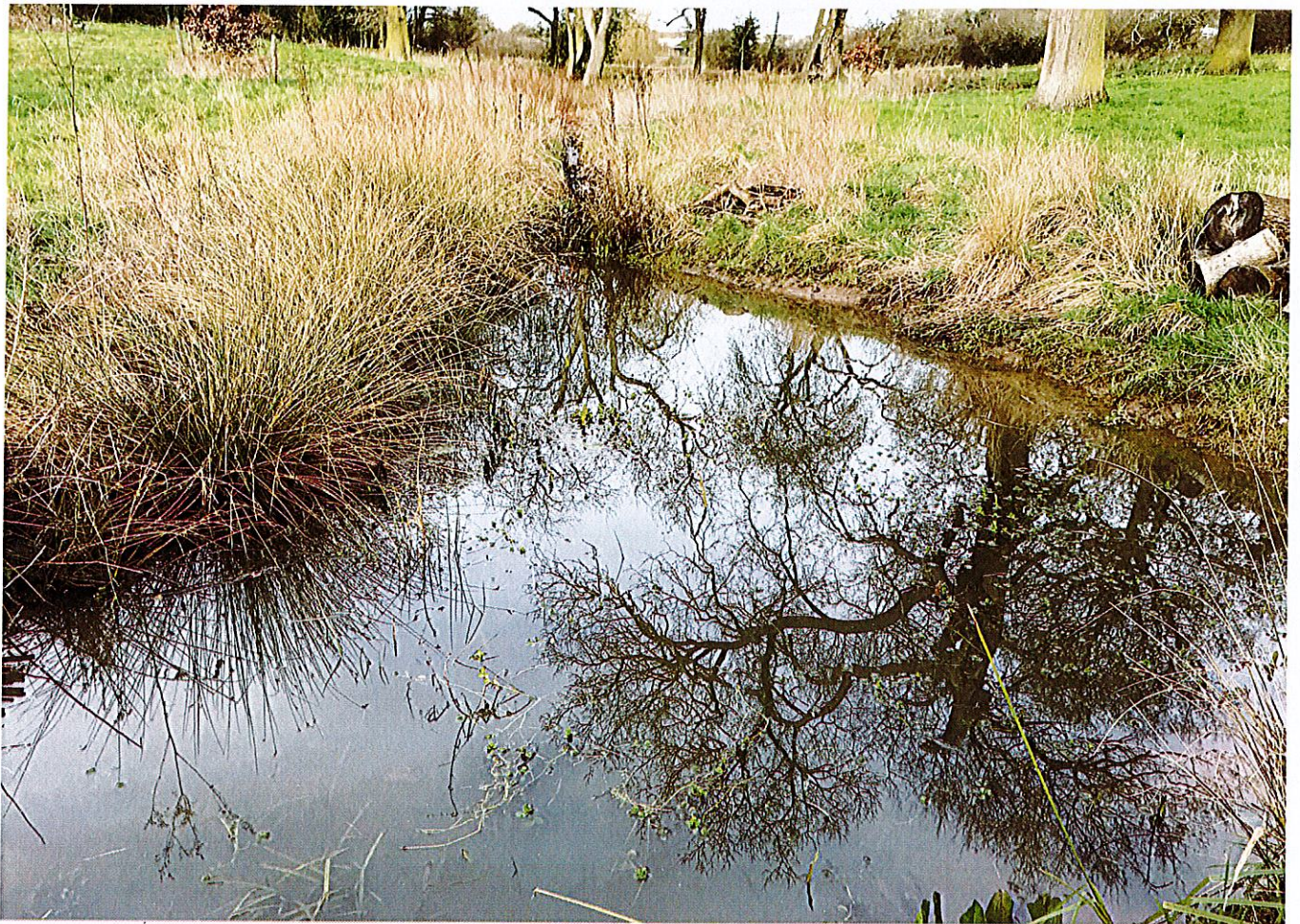
East 2 - small pond