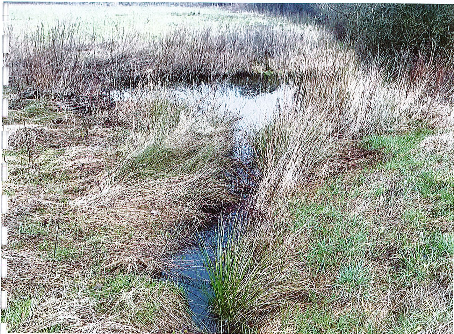
West small pond