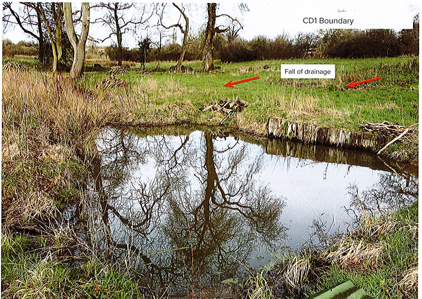
East 1 - small pond