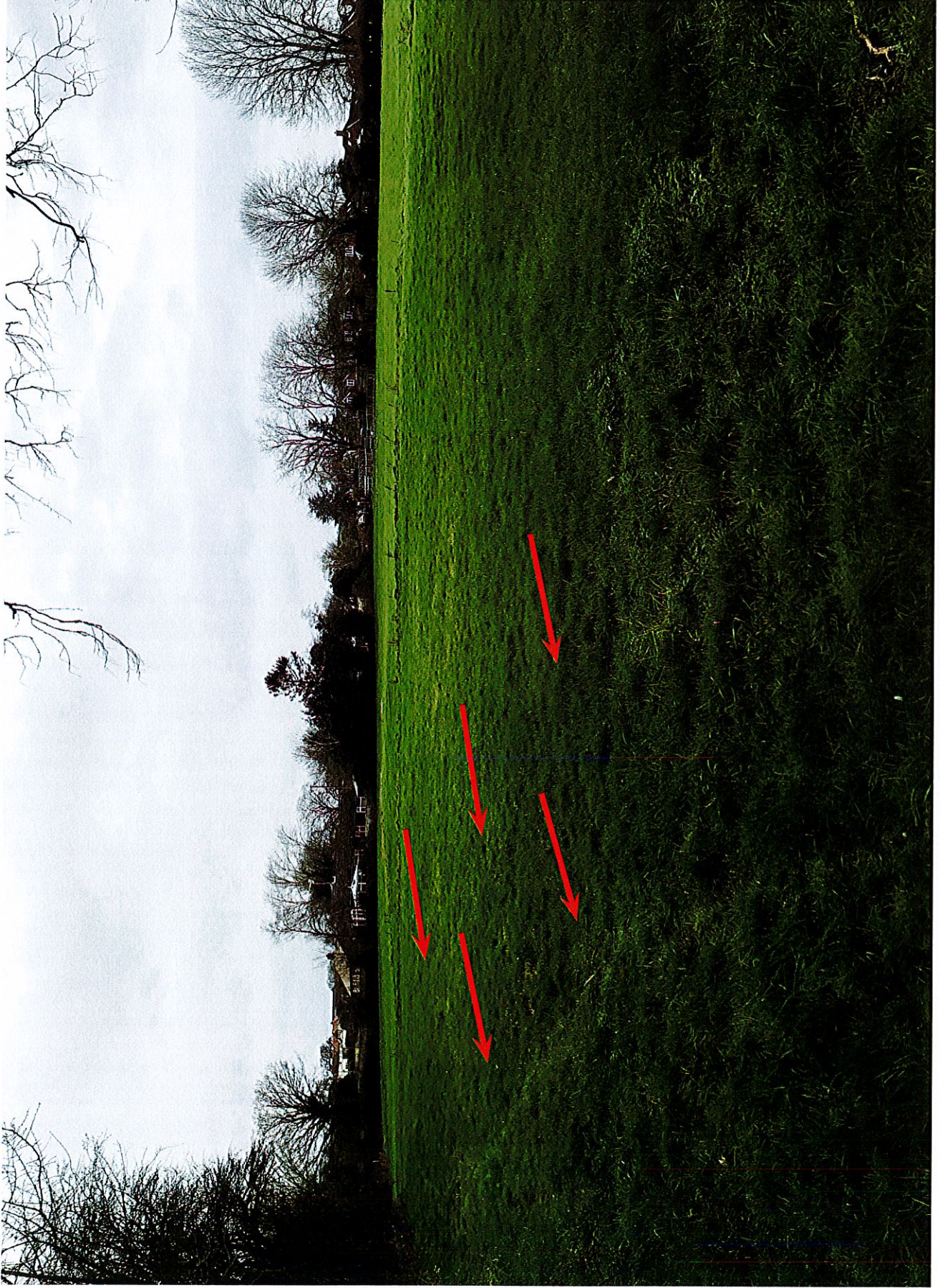
CD1 - Cowards Lane fall of land and drainage onto Wildlife Site