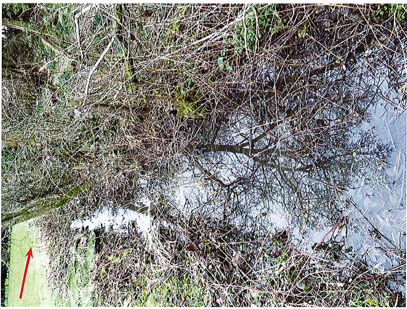
CD1 - Cowards Lane drainage ditch